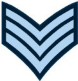
Sergeant / Sergant