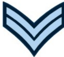
Corporal / Caporal